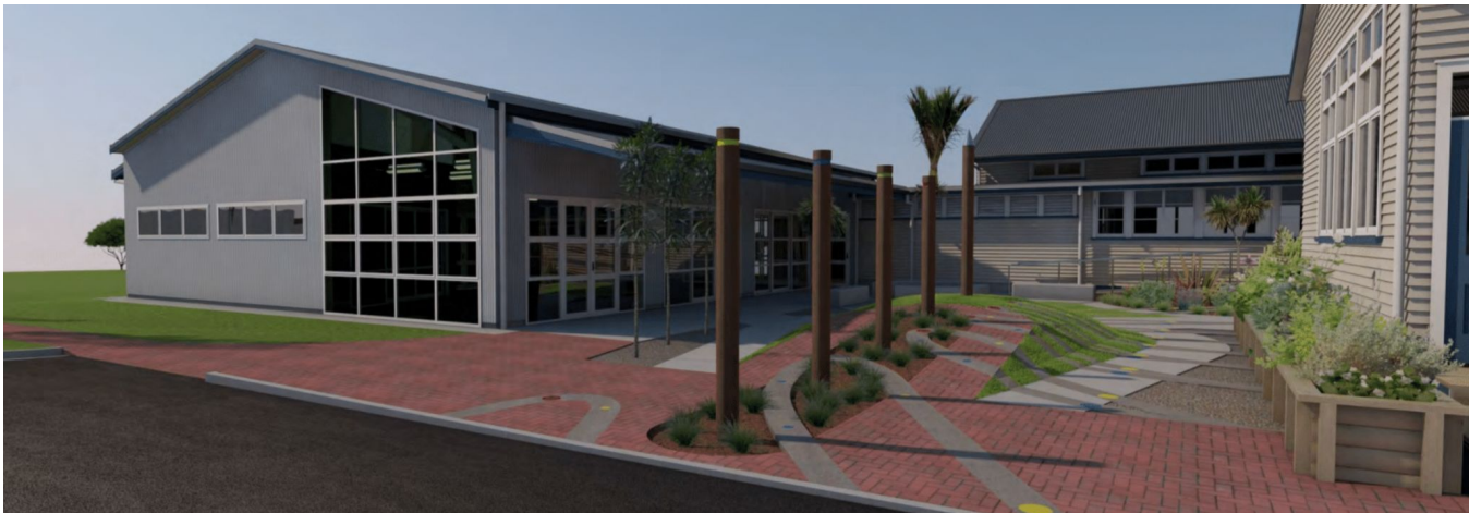
Concept design images